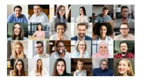
All other employees